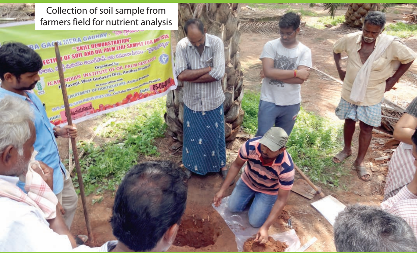
Collection of soil sample from farmers field for nutrient analysis