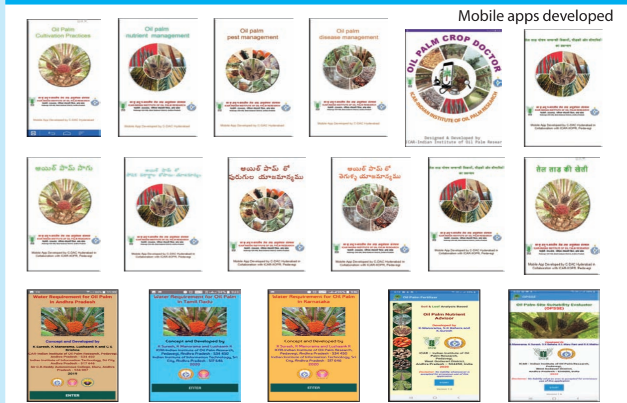
Mobile apps developed