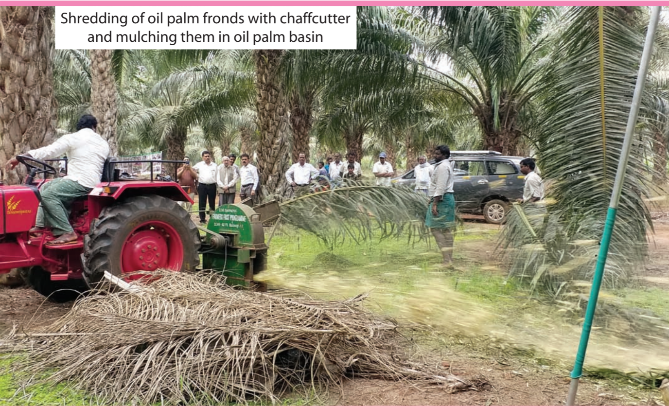
Shredding of oil palm fronds with chaffcutter and mulching them in oil palm basin