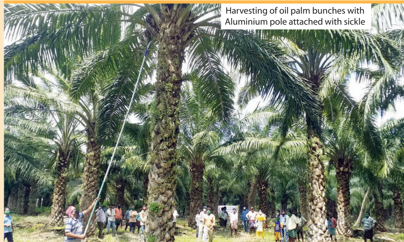
Harvesting of oil palm bunches with Aluminium pole attached with sickle