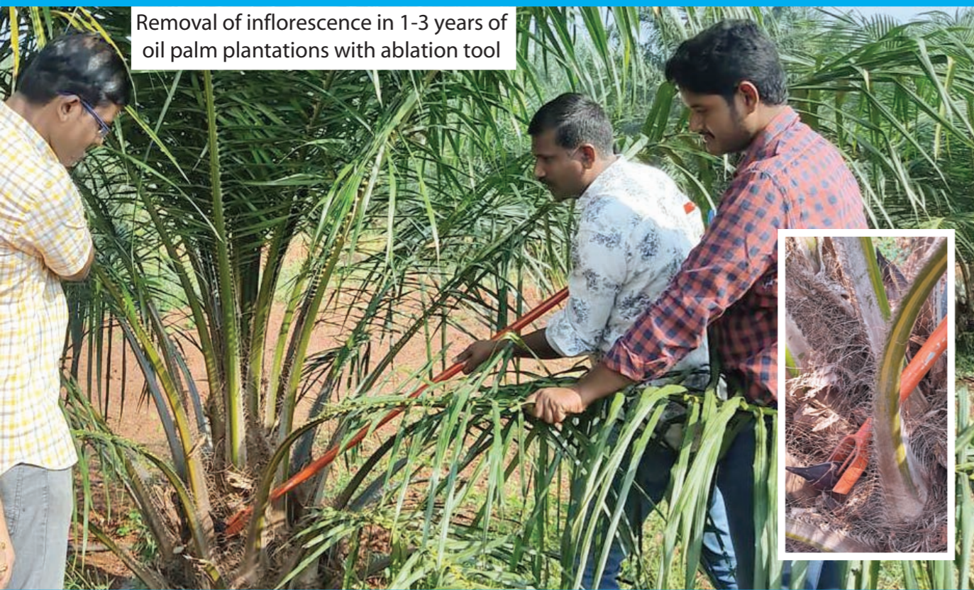
Removal of inflorescence in 1-3 years of oil palm plantations with ablation tool