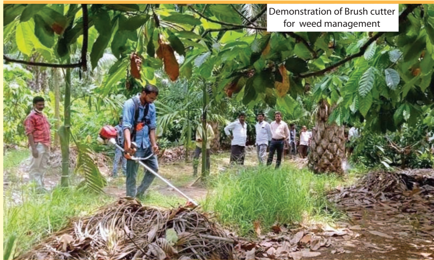
Demonstration of Brush cutter for weed management