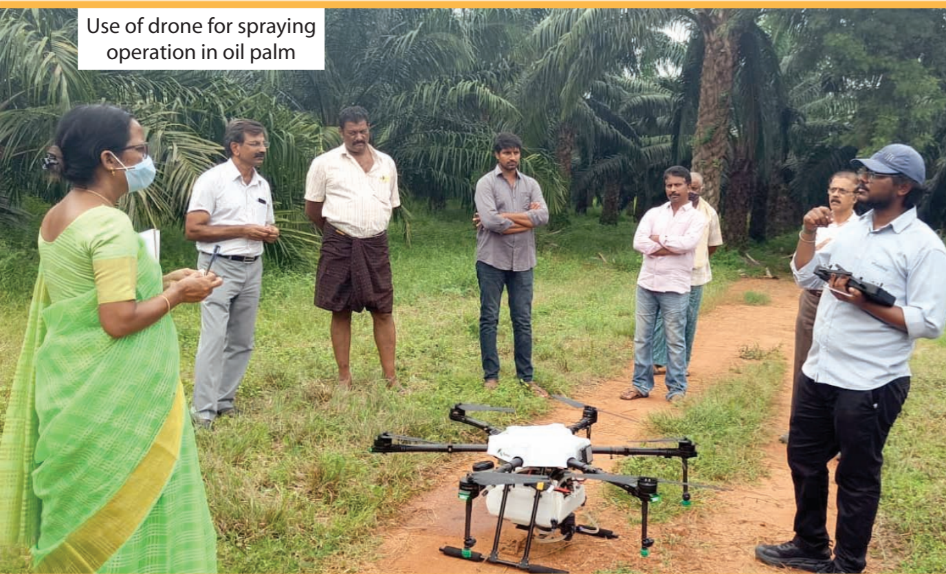
Use of drone for spraying operation in oil palm