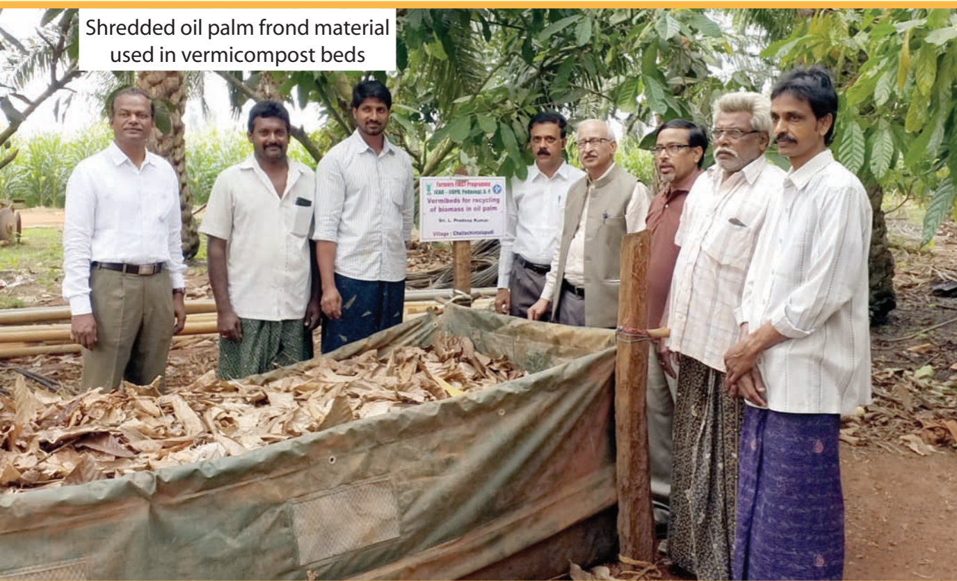
Shredded oil palm frond material used in vermicompost beds